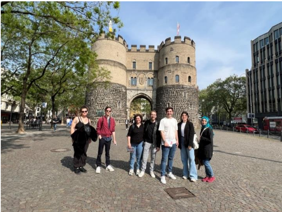
Our students during the Cologne City Tour.

In addition to these museum visits, our students enthusiastically participated in a city tour, which allowed them to witness Cologne's vibrant and dynamic atmosphere. They meandered through bustling streets, lined with charming architecture, and absorbed the city's pulsating energy. A particular highlight of the tour was their visit to the Cologne Cathedral, a majestic masterpiece that stood as a testament to the city's enduring history and architectural prowess. The students were humbled by the grandeur of the cathedral's interior and learned about its cultural and religious significance.