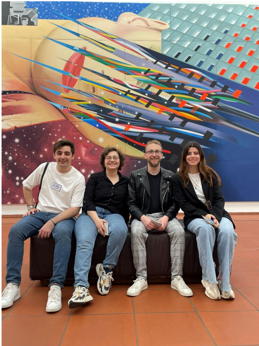
Our TGU students during their visit to Ludwig Museum in Cologne

During the excursion, the first and last few days were dedicated to immersing our students in Cologne's rich cultural offerings. Our group of eager learners embarked on an exciting journey, starting with visits to two prominent museums that hold significant historical and artistic treasures: the Ludwig Museum and the Wallraf-Richartz Museum. At the Ludwig Museum, the students were captivated by an array of modern and contemporary art pieces. The striking exhibits showcased the boundless creativity of renowned artists, both local and international, offering a glimpse into the ever-evolving world of art. From thought-provoking paintings to thought-provoking sculptures, the students were encouraged to interpret the artwork's meaning and appreciate the various artistic techniques.