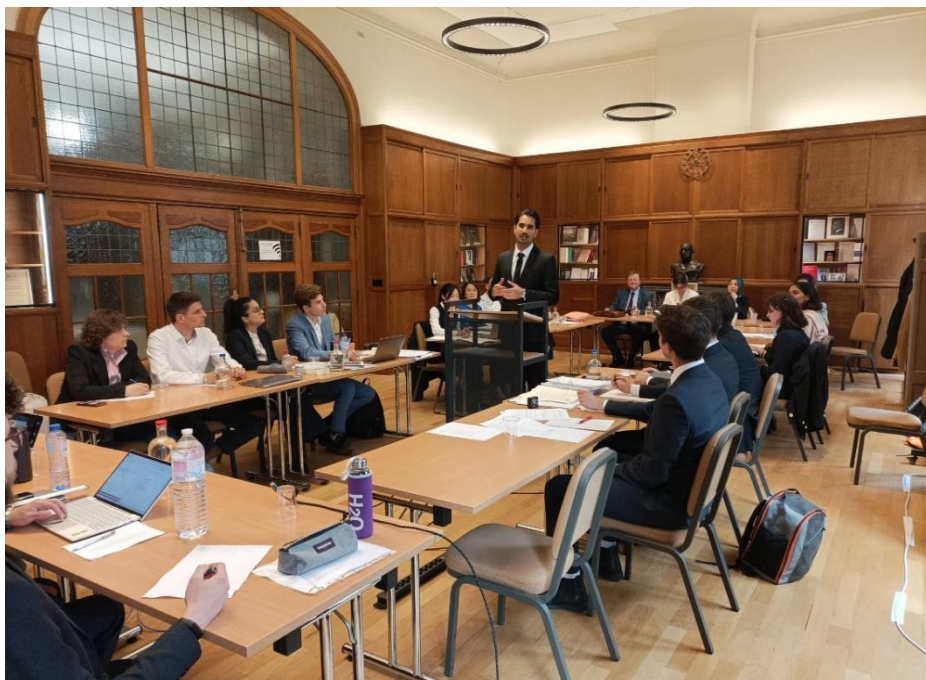
All students during the Moot Court in Brussels