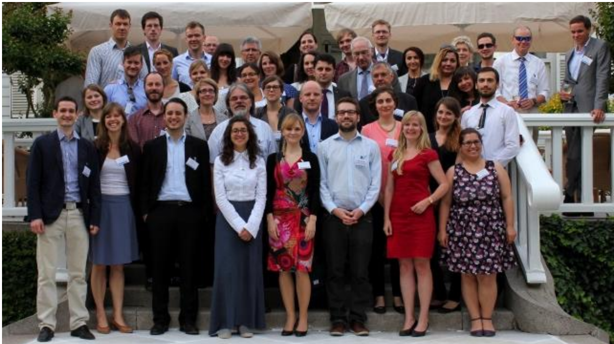
COMOS Conference in Istanbul, Summer 2014.