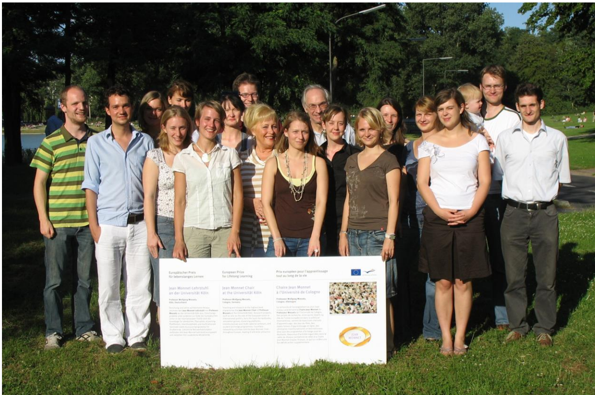
The Jean Monnet Team, Summer 2007.

In the past decade the Coelner Monnet Vereinigung für Europa Studien (COMOS) e.V. served as a valuable platform to maintain contacts and discuss topics of EU integration among members and alumni of the chair.